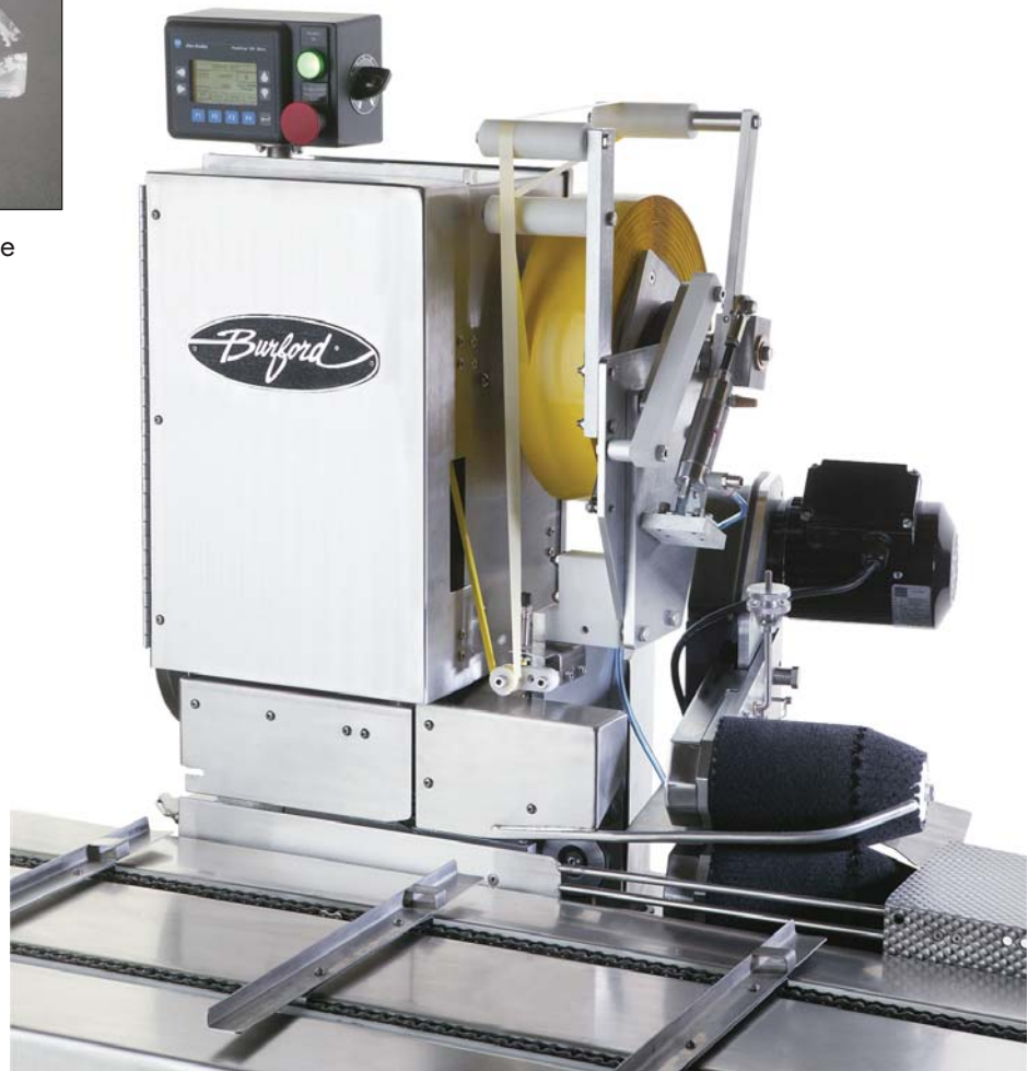
MODEL TCS-100R SHOWN WITH OPTIONAL CONVEYOR AND PRINTER