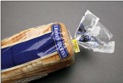
Clean, Dependable Printed Tape

MODEL TCS-100R RIGHT HAND, MODEL TCS-100L LEFT HAND